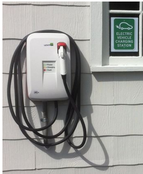
Florida to New York Chevy Bolt Electric Car

We decided to avoid the traffic and construction on I-4 around Orlando by taking Florida 417 which is a toll road and about eight miles longer, but less stressful. This proved to be a good strategy. We arrived home a little after 11:00 am with 65 miles remaining.